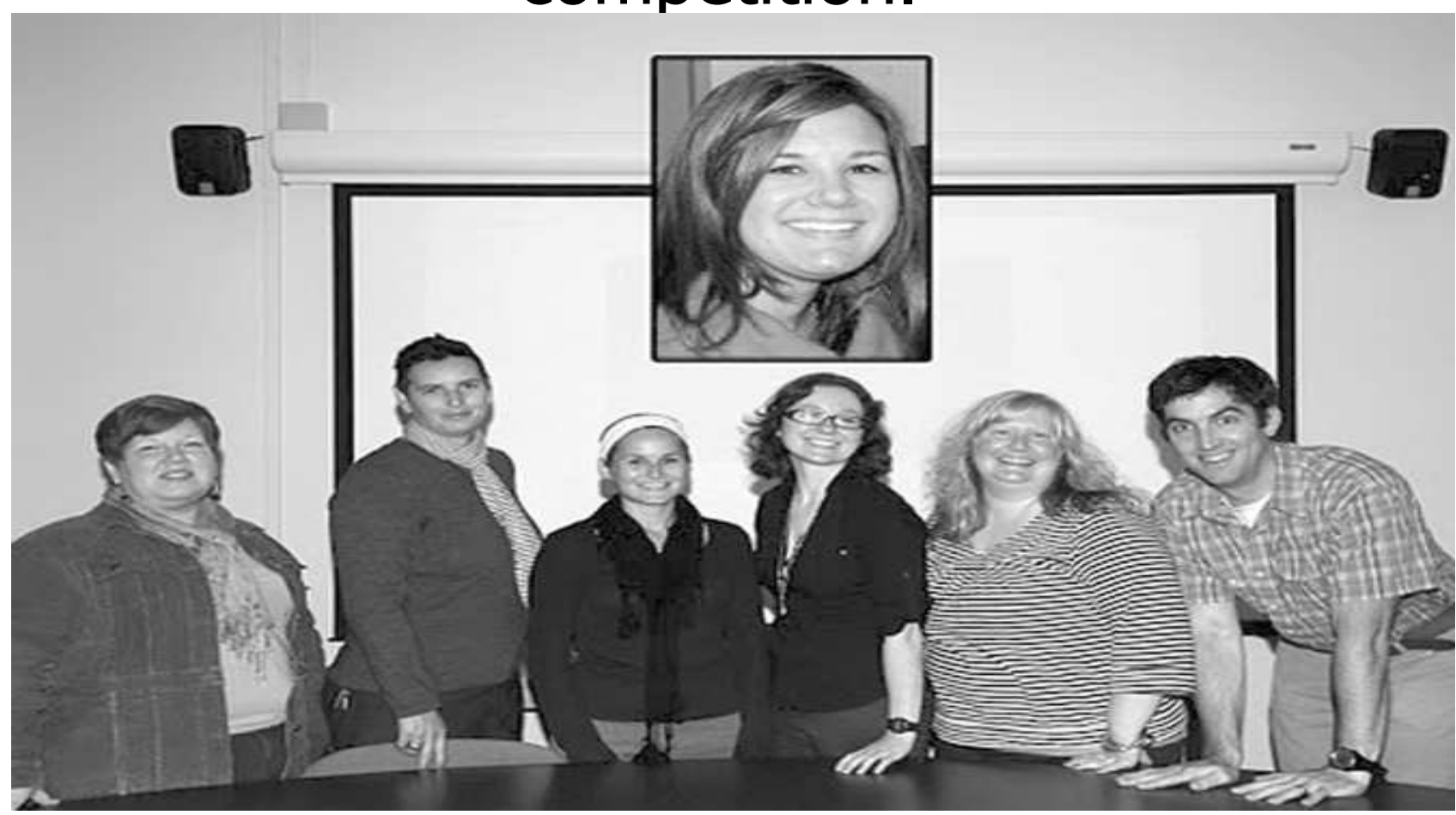
New Community Opportunities Center at ILRU – Independent Living Research Utilization

This is collaboration, not a competition.